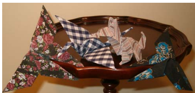
Above: Interesting textures are achieved with stripes, flowers, and checks in this Rosebud Butterfly, Navy & White Gingham Crane, Purple & Mauve Pinstripe Dog, and Blue and Black Floral Butterfly.

Right: Mother crane with twelve babies, all folded from a single 20 inch square of cotton fabric which was precisely sliced at the corners to form the 5 inch babies. This amazing sculpture is nesting on a lovely origami box made from a cotton Hawaiian floral . A close-up is on the next page.